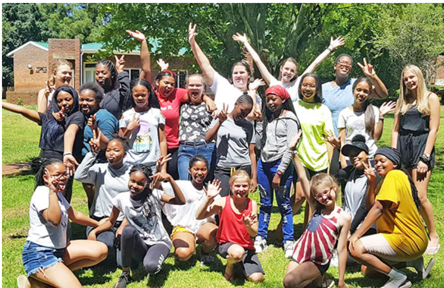
BELOW: First day of 2019 - Team Building Fun & Games