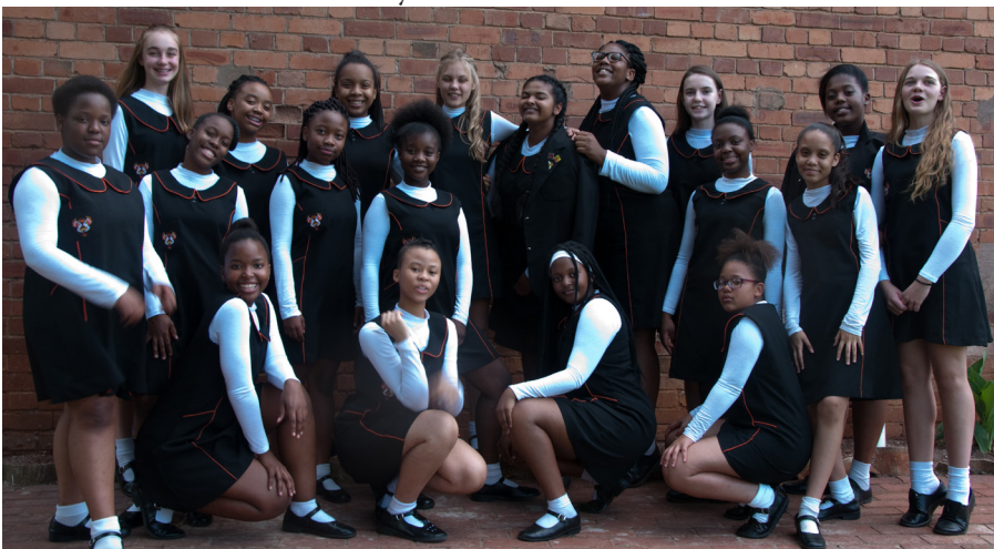
ABOVE: Final day of 2018 - The holidays await...